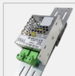
Xclone 12V power supply