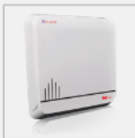
Xclone long range reader