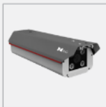
License plate recognition camera