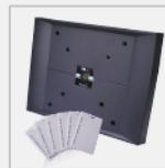
Mid range reader