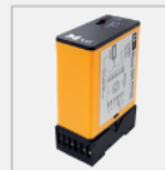
EWI loop detector