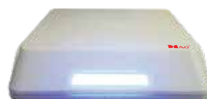
Blue Successful read card