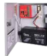
NVS1230P Power Supply