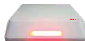
Red Power on