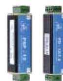
Surge Protection Data and 12V